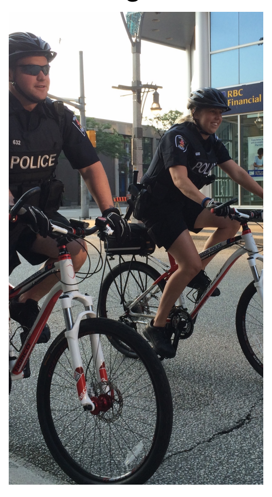
Protect your bike and register today